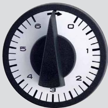
type 134 ..., 136.2